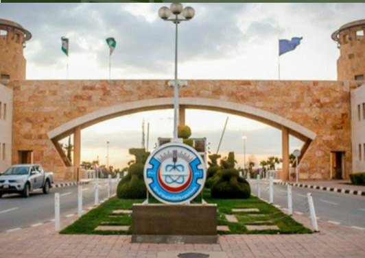
Jordan University of Science and Technology (JUST) Campus